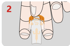
3. Place the lancet against the puncture site.