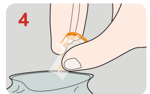
5. Dispose lancet after use. Do not use if the seal has been damaged or broken.